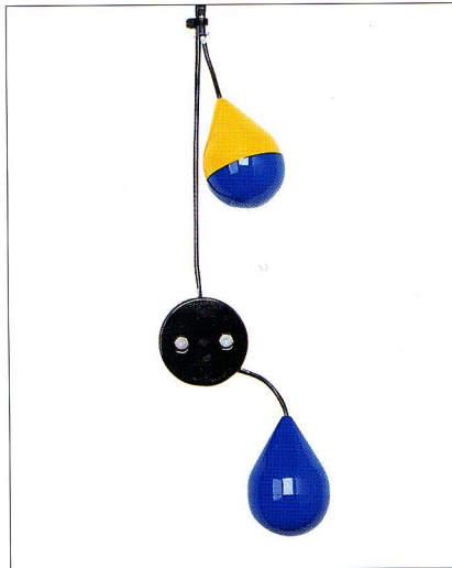
MS "Mini Switch"