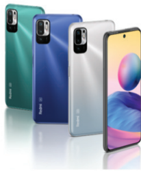
Redmi Note 10 5G (8/128)

XMI-6934177748479 (Chrome Silver) XMI-6934177748486 (Aurora Green) XMI-6934177748509 (Nighttime Blue) XMI-6934177748523 (Graphite Gray)