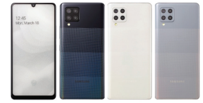
Samsung Galaxy A42 5G (8/128GB)

SSG-PSMA426BZKHTHL (Black) SSG-PSMA426BZWHTHL (White) SSG-PSMA426BZAHHTHL (Gray)