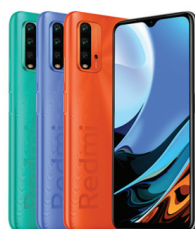
Redmi 9T (6/128)

XMI-6934177735400 (Sunrise Orange) XMI-6934177735387 (Twilight Blue) XMI-6934177735370 (Ocean Green) XMI-6934177735394 (Carbon Gray)