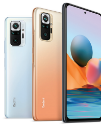
Redmi Note 10 Pro (6/128)

XMI-6934177748479 (Chrome Silver) XMI-6934177748486 (Aurora Green) XMI-6934177748509 (Nighttime Blue) XMI-6934177748523 (Graphite Gray)