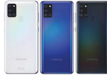
Samsung Galaxy A21s (6/128GB)

SSG-PSMA125FZKHTHL (Black) SSG-PSMA125FZBHHTHL (Blue)