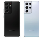
Samsung Galaxy S21 Ultra 5G

SSG-PSMG998BZKDTHL (Black 12/128GB) SSG-PSMG998BZSDTHL (Silver 12/128GB) SSG-PSMG998BZSGTHL (Black 12/256GB) SSG-PSMG998BZKGTHL (Silver 12/256GB) SSG-PSMG998BZKHTHL (Black 16/512GB) SSG-PSMG998BZSHTHL (Silver 16/512GB)