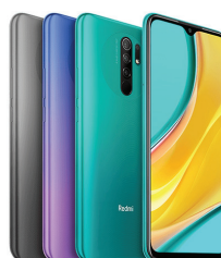
Redmi 9 (64)

XMI-6934177726910 (Midnight Gray) XMI-6934177726958 (Sunrise Orange) XMI-6934177726934 (Twilight Blue)