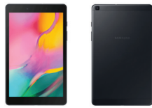
Galaxy Tab A 8 (2019) SSG-PSMT295NZKATHL (Black) SSG-PSMT295NZSATHL (Silver)