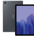
Galaxy Tab A7 (10.4") WIFI SSG-PSMT500NZAETHL (Gray) SSG-PSMT500NZDETHL (Gold)