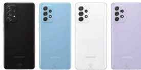
Galaxy A52 8/128GB

SSG-PSMA525FZKHTHL (Black) SSG-PSMA525FZBHHTHL (Blue) SSG-PSMA525FZWHHTHL (White) SSG-PSMA525FLVHTHL (Violet)