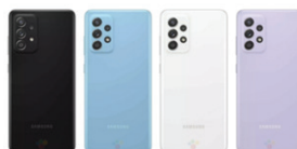
Galaxy A52 5G 8/128GB

SSG-PSMA526BZKGTHL (Black) SSG-PSMA526BZBGHTHL (Blue) SSG-PSMA526BZWGHTHL (White) SSG-PSMA526BLVGTHL (Violet)