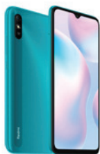
Redmi 9A (32)

XMI-6941059648413 (Granite Gray) XMI-6941059648390 (Peacock Green) XMI-6941059648406 (Sky Blue)