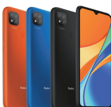
Redmi 9C (64)

XMI-6941059648413 (Granite Gray) XMI-6941059648390 (Peacock Green) XMI-6941059648406 (Sky Blue)