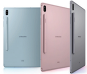
Galaxy Tab S6 Lite/64GB WIFI SSG-PSMP610NZAATHL (Gray) SSG-PSMP610NZBATHL (Blue) SSG-PSMP610NZIATHL (Pink)