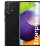
Samsung Galaxy A52 EE 8/128GB