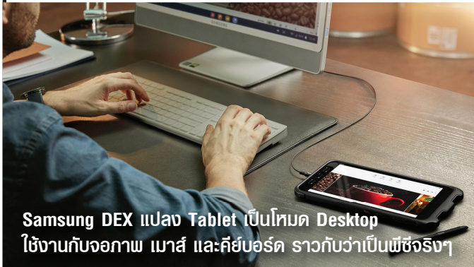
Samsung DEX แปลง Tablet เป็นโหมด Desktop ใช้งานกับจอภาพ เม้าส์ และคีย์บอร์ด ราวกับว่าเป็นพีซีจริงๆ

Galaxy Tab Active 3 แท็บเล็ตสุดอึด!! กันน้ำกันฝุ่น กันกระแทกได้ถึง 1.5 เมตร มีโหมด No Battery สลับไปใช้งานจากแหล่งจ่ายไฟตรง โดยไม่ผ่านแบตเตอรี่ของตัวเอง