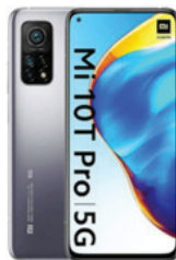
Mi 10T Pro

XMI-6934177725029 (Aurora Blue) XMI-6934177724992 (Cosmic Black) XMI-6934177725012 (Lunar Silver)