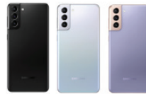
Samsung Galaxy S21+ 5G

SSG-PSMG996BZKDTHL (Black 8/128GB) SSG-PSMG996BZSDTHL (Silver 8/128GB) SSG-PSMG996BZVDTHL (Violet 8/128GB) SSG-PSMG996BZKGTHL (Black 8/256GB) SSG-PSMG996BZSGTHL (Silver 8/256GB) SSG-PSMG996BZVGTHL (Violet 8/256GB)