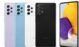
Samsung Galaxy A72 8/128GB

SSG-PSMA725FZKGTHL (Black) SSG-PSMA725FZBGHTHL (Blue) SSG-PSMA725FZWGHTHL (White) SSG-PSMA725FLVGTHL (Violet)