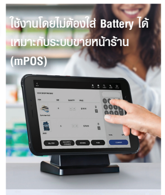
ใช้งานได้โดยไม่ต้องใส่ Battery ได้ เหมาะกับระบบขายหน้าร้าน (mPOS)