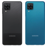
Samsung Galaxy A12 (4/128GB)

SSG-PSMA125FZKHTHL (Black) SSG-PSMA125FZBHHTHL (Blue)