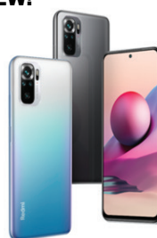
Redmi Note 10 S (8/128)

XMI-6934177739637 (Ocean Blue) XMI-6934177739590 (Onyx Gray) XMI-6934177739613 (Pebble White)