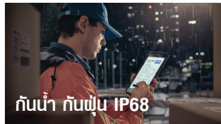
กันน้ำ กันฝุ่น IP68