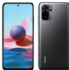
Redmi Note 10 (6/128)

XMI-6934177735400 (Sunrise Orange) XMI-6934177735387 (Twilight Blue) XMI-6934177735370 (Ocean Green) XMI-6934177735394 (Carbon Gray)