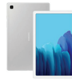
Galaxy Tab A7 (10.4") LTE SSG-PSMT505NZAETHL (Gray) SSG-PSMT505NZDETHL (Gold)