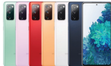
Samsung Galaxy S20 FE 5G 8/256GB

SSG-PSMG781BLVGTHL (VIOLET) SSG-PSMG781BZBGTHL (BLUE) SSG-PSMG781BZGGTHL (GREEN) SSG-PSMG781BZOGTHL (ORANGE) SSG-PSMG781BZRGTHL (RED) SSG-PSMG781BZWGTHL (WHITE)