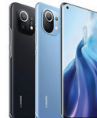
Mi 11 (8/256)

XMI-6934177736902 (Boba Black) XMI-6934177736889 (Bubblegum Blue) XMI-6934177736896 (Peach Pink) XMI-6934177736872 (Boba Black)