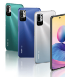
Redmi Note 10 5G (4/128)

XMI-6934177741371 (Chrome Silver) XMI-6934177741364 (Aurora Green) XMI-6934177741340 (Nighttime Blue) XMI-6934177741401 (Graphite Gray)