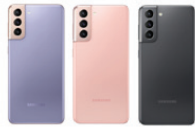
Samsung Galaxy S21 5G

SSG-PSMG991BZVDTHL (Violet 8/128GB) SSG-PSMG991BZIDTHL (Pink 8/128GB) SSG-PSMG991BZADTHL (Gray 8/128GB) SSG-PSMG991BZVGTHL (Violet 8/256GB) SSG-PSMG991BZIGTHL (Pink 8/256GB) SSG-PSMG991BZAGTHL (Gray 8/256GB)