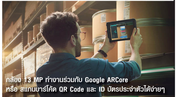
กล้อง 13 MP ทำงานร่วมกับ Google ARCore หรือ สแกนบาร์โค้ด QR Code และ ID บัตรประจำตัวได้ต่างๆ