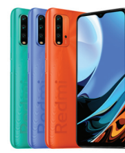
Redmi 9T (4/64)

XMI-6941059645856 (Carbon Grey) XMI-6941059645771 (Ocean Green) XMI-6941059645795 (Sunset Purple)