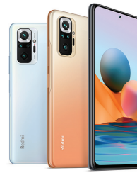
Redmi Note 10 Pro (8/128)

XMI-6934177731594 (Onyx Gray) XMI-6934177734939 (Gracier Blue) XMI-6934177734915 (Gradient Bronze)