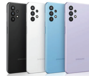
Samsung Galaxy A32 (8/128GB)

SSG-PSMA325FZKHTHL (Black) SSG-PSMA325FZBITHL (Blue) SSG-PSMA325FZWITHL (White) SSG-PSMA325FLVITHL (Violet)