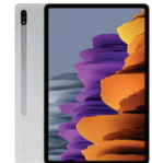
Galaxy Tab S7+ (12.4" LTE) SSG-PSMT975NZNATHL (Mystic Bronze) SSG-PSMT975NZKATHL (Mystic Black)