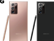
Galaxy Note20 Ultra 5G

SSG-PSMN986BZKWTHL (Black 256GB) SSG-PSMN986BZNVTHL (Bronze 256GB) SSG-PSMN986BZKPETHL (Black 512GB) SSG-PSMN986BZNPETHL (Bronze 512GB)