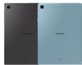
Galaxy Tab S6 Lite/64GB LTE SSG-PSMP615NZAATHL (Gray) SSG-PSMP615NZBATHL (Blue)