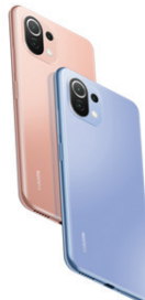
Mi 11 Lite (8/128)

XMI-6934177736902 (Boba Black) XMI-6934177736889 (Bubblegum Blue) XMI-6934177736896 (Peach Pink) XMI-6934177736872 (Boba Black)