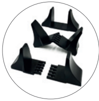
Tower stand kit