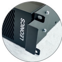
Rack mount bracket