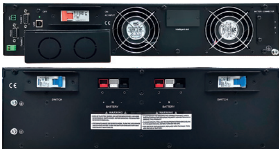
UPS with Battery Pack