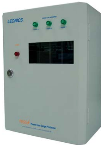
LS Surge Diverter with Enclosure

LS-series Surge Diverters provide high energy surge diversion for protection against power surge caused by external sources as lightning strikes and substation switching. LS-series Surge Diverter is designed for mounting at point-of-entry / service entrance, main switchboard or distribution board, sub-distribution board for preventing damage to switchboards and your equipments. Protection and replacement status are indicated by LED indicators. And remote alarm contact provide dry contact signal to allow remote status monitoring.