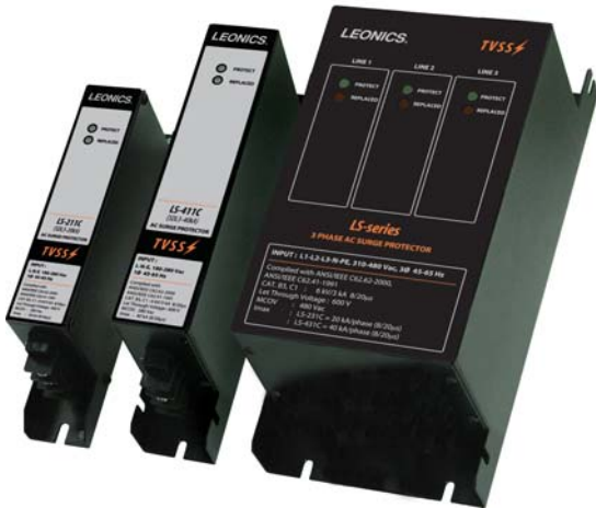
LS Surge Diverter