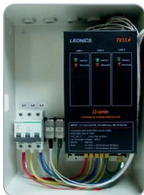
Sample of inside enclosure