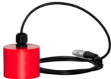
TEV Loc sensor TEV C900