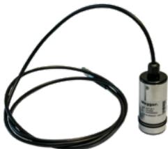
Acoustic-contact probe ACP30-1