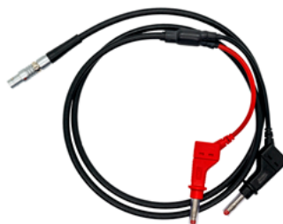
VK 155 LRHR cable