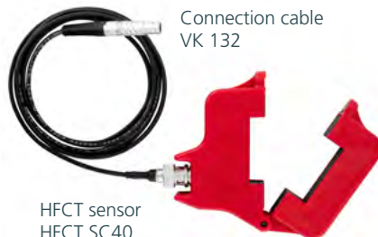
Connection cable VK 132