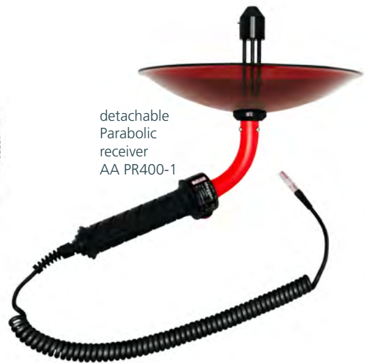
detachable Parabolic receiver AA PR400-1