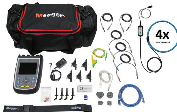
MPQ1000 Gold Plus Kit C/N MPQ1000-G-KIT-PLUS

Includes MPQ1000 analyzer, voltage leads, SD card, USB cable, ethernet cable, universal power adapter, soft-sided carry bag, plus hanging strap, voltage lead plunger clips, and 3 MCCV6000-18 (four range flex 18 cm ID) CTs