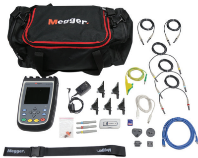
MPQ1000 Basic Kit C/N MPQ1000-BASIC

Includes MPQ1000 analyzer, voltage leads, SD card, USB cable, ethernet cable, universal power adapter, soft-sided carry bag plus fuse adapters and hanging strap. Does not include current clamps.