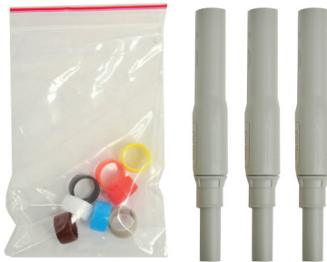
Optional Fuse Adapter Kit (1008-645)