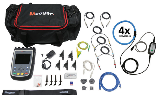
MPQ1000 Silver Plus Kit C/N MPQ1000-S-KIT-PLUS

Includes MPQ1000 analyzer, voltage leads, SD card, USB cable, ethernet cable, universal power adapter, soft-sided carry bag, plus hanging strap, voltage lead plunger clips, and 4 MCCV6000-27 (four range flex 27 cm ID) CTs