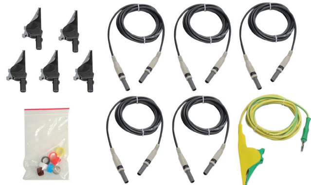
MPQ1000 Voltage Lead Set (2007-259)