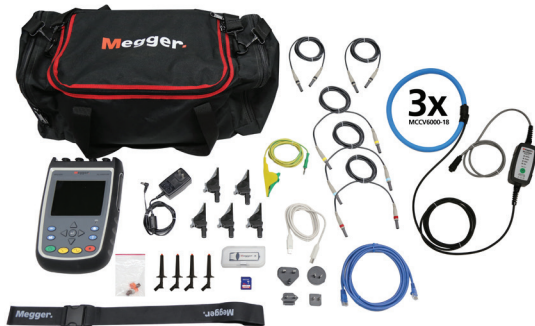
MPQ1000 Silver Kit C/N MPQ1000-S-KIT

Includes MPQ1000 analyzer, voltage leads, SD card, USB cable, ethernet cable, universal power adapter, soft-sided carry bag, plus hanging strap, voltage lead plunger clips, and 3 MCCV6000-27 (four range flex 27 cm ID) CTs