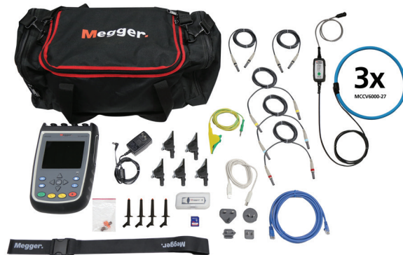
MPQ1000 Gold Kit C/N MPQ1000-G-KIT

Includes MPQ1000 analyzer, voltage leads, SD card, USB cable, ethernet cable, universal power adapter, soft-sided carry bag plus fuse adapters and hanging strap. Does not include current clamps.