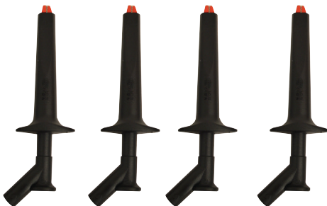
Optional Plunger Clips (1008-756)