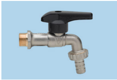
Hose ball bib-cock with hose tail connection and aluminum handle