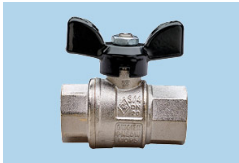
Full bore ball valve, F/F threaded, with aluminum T-handle