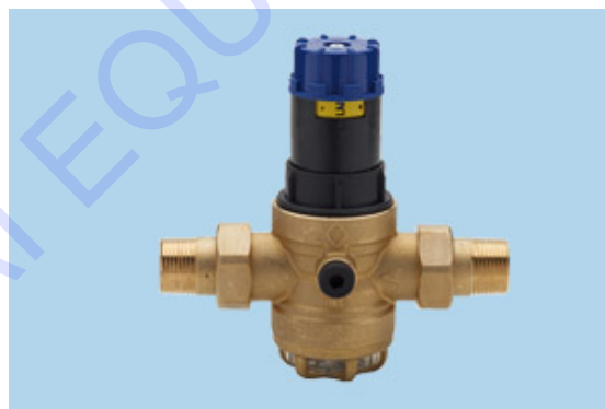
Pressure reducing and regulating valve