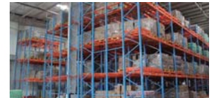
PUSH BACK RACK