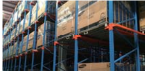
DRIVE IN RACKING