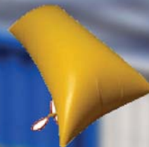
VINYL DUNNAGE BAG