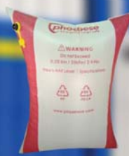
PP DUNNAGE BAG