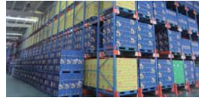
SHUTTLE CAR PALLET RACKING