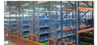
MICRO RACK / SHELVING RACK