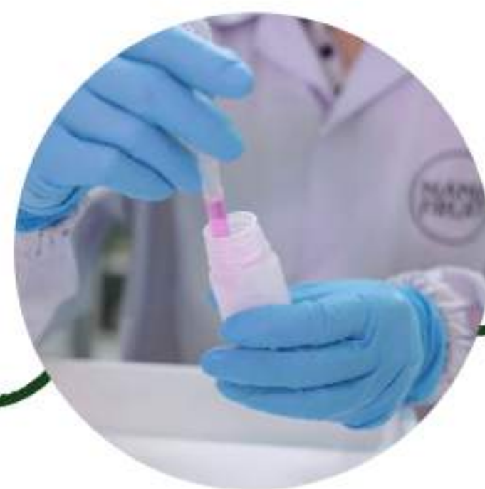
Develop products for the highest quality

Ready to deliver products on time to consumers.