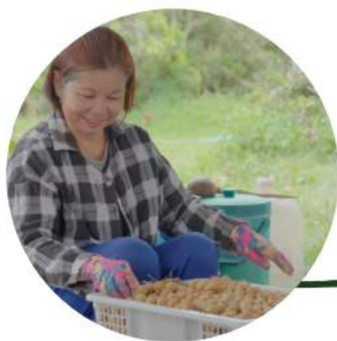
Fresh longan from our Co Farming

在RK FOOD生产优质龙眼干超过30年后，我们转型为“娜娜水果”。除了干果产品外，我们继续开发其他健康产品，服务消费者从过去到现在。