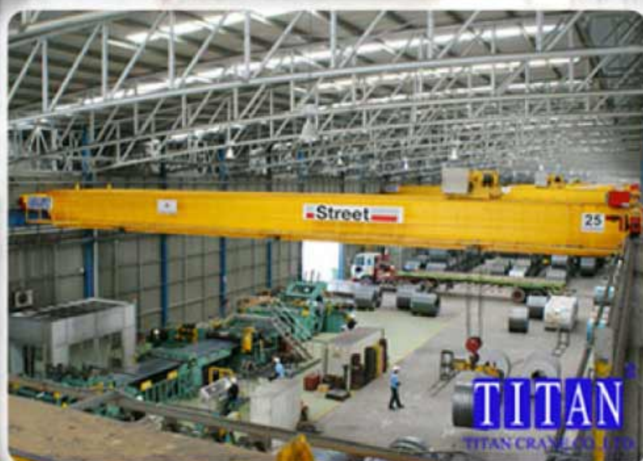
(Double Girder) Overhead Cranes