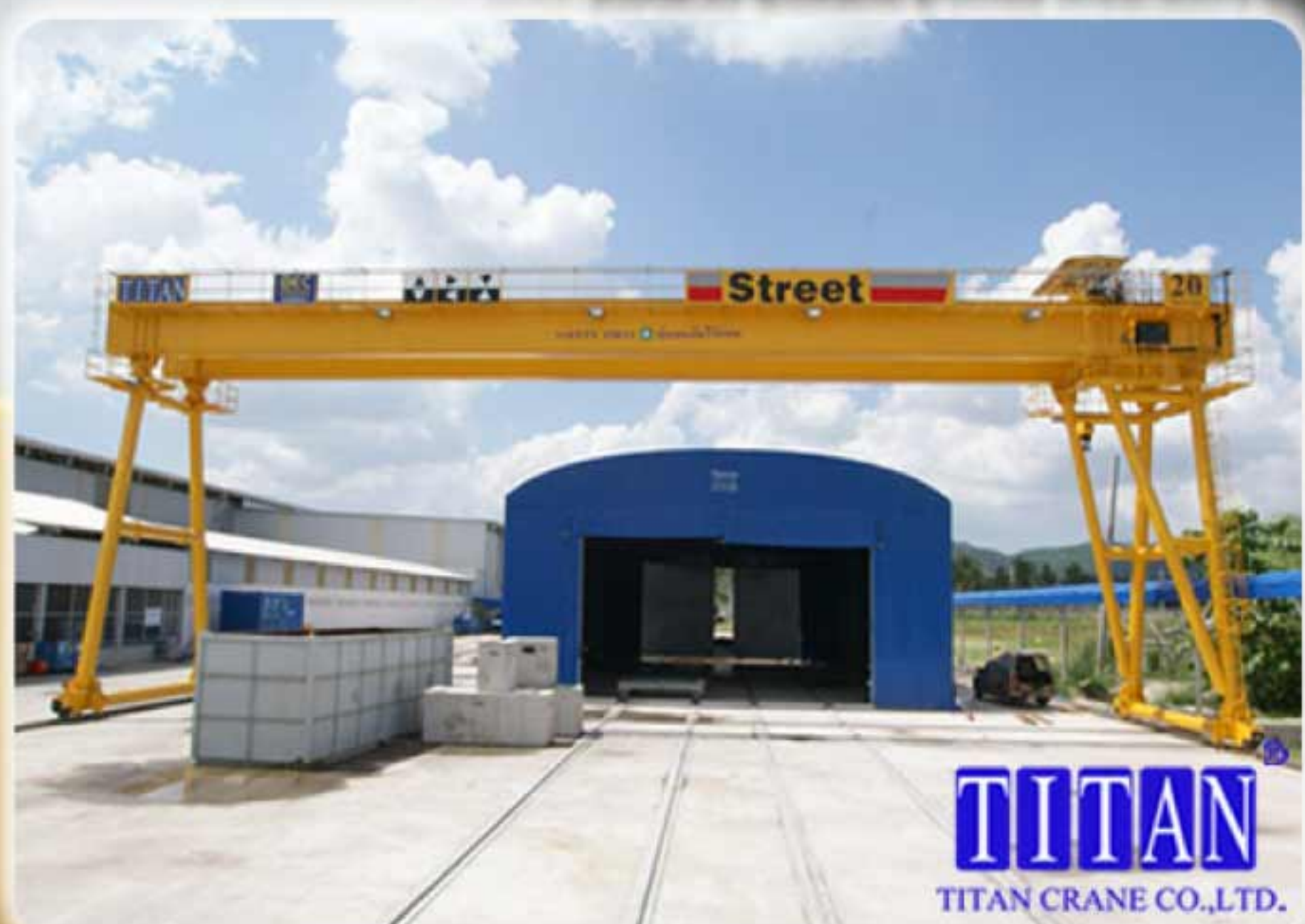
(Double Girder) Gantry Cranes

Low Cost Reliable & Safety Durable & Rugged Ultra Power Saving 100% Water-resistant Compact & Lightweight