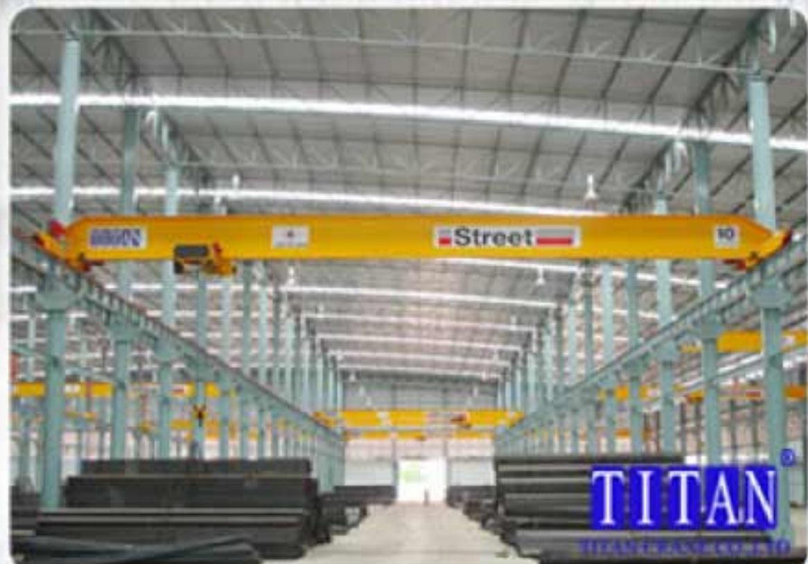
(Single Girder) Overhead Cranes