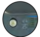
Built in scale level.