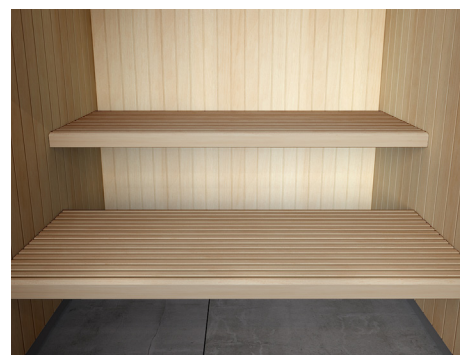
ESR, aspen Narrow-slat interior in aspen. ESR, alder Narrow-slat interior in alder.