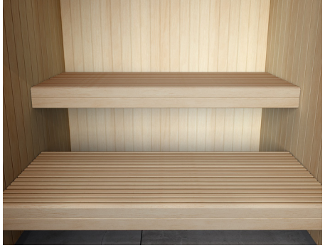
aspen with reinforced construction. For larger parties.