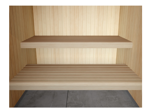
E68 Pro, aspen Wide-slat interior in aspen with reinforced construction. For larger parties.