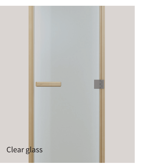
Chose between clear glass, tinted or frosted*.