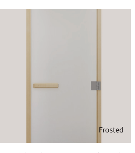
*Available glass options vary dependent on the sauna room model selected