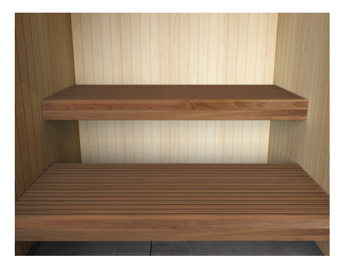
ESR Pro, aspen Narrow-slat interior in ESR Pro, alder Narrow-slat interior in alder with reinforced construction. For larger parties.