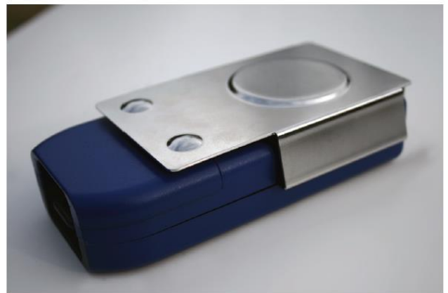
Wipe Test Plate