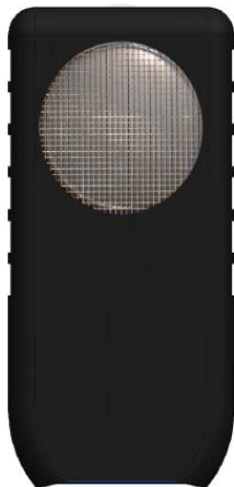
View of Back with Ruggedized boot