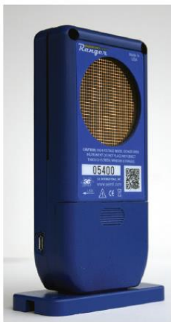
Ruggedized boot and Stand Included