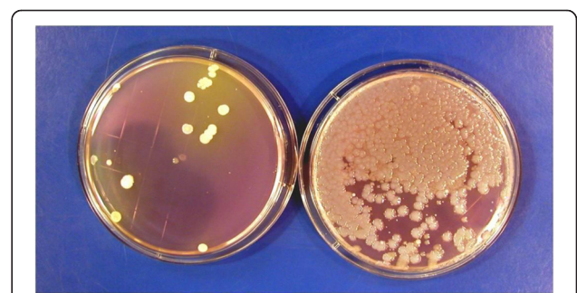
Fig. 1 Contact agar plate cultures showing bacterial colonies recovered from a patient's overbed table before (left) and after (right) the surface was cleaned by a housekeeper using contaminated quaternary ammonium disinfectant. Colonies on right are Serratia marcescens and Achromobacter xylosoxidans

Contamination of disinfectant solutions can occur, particularly if recommendations for their use are not followed [19–21]. For example, Kampf et al. recently reported that 28 buckets from 9 hospitals contained surface-active disinfectants (e.g., quaternary ammonium solutions) that were contaminated with Achromobacter or Serratia strains [21]. Buckets and roles of wipes had not been handled according to manufacturer recommendations. In studies that involved culturing high-touch surfaces in patient rooms before and shortly after housekeepers had performed routine cleaning, we found that cultures obtained from several surfaces in one room after cleaning yielded large numbers of Serratia and smaller numbers of Achromobacter which were not present before cleaning [Fig. 1] [20]. The housekeeper's bucket of quaternary ammonium-based disinfectant contained 9.3 \times 10^4 CFUs/ml of gram-negative bacilli (mostly Serratia marcescens and fewer numbers of Achromobacter xylosoxidans ). Pulsed-field gel electrophoresis demonstrated that Serratia isolates recovered from the disinfectant were the same strains as those recovered from surfaces in the patient room. Genome sequencing of one of the Serratia strains by collaborating investigators revealed that it contained four different qac resistance genes that permitted the organism to grow and survive in the disinfectant (unpublished data). If