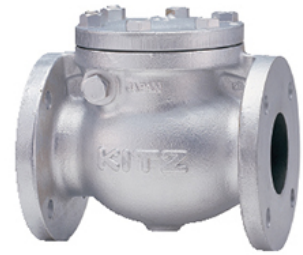
Fig : 125FCOS

IRON, COVER MATERIAL : CAST IRON, DISC MATERIAL : STAINLESS STEEL, KITZ