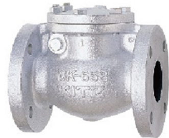
Fig : 10FCOU

IRON, COVER MATERIAL : CAST IRON, DISC MATERIAL : STAINLESS STEEL, KITZ