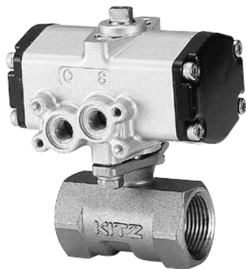
Fig. C-UTE (Reduced bore)