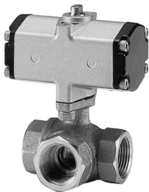
Fig. C-TNE (Standard bore)