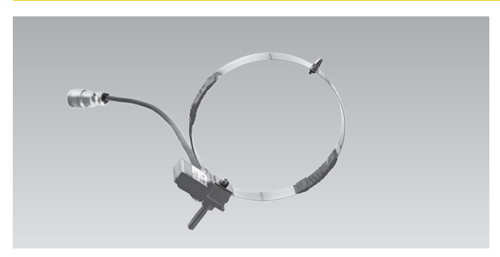
The OU displacement transducer is a combination of a round plate spring and strain gauges. It is mounted with its contact tip pressed against a structure. When displacement occurs in the structure, the plate spring is deformed and the amount of output proportional to the amount of displacement can be output.