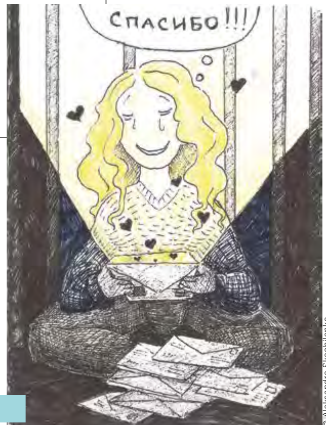
Drawing done by Aleksandra while in detention.

Aleksandra Skochilenko Write for Rights Amnesty International 1 Easton Street London WC1X 0DW United Kingdom