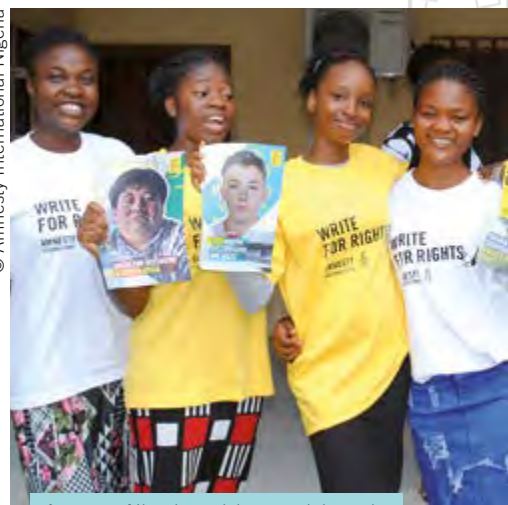
Amnesty Nigeria activists participate in Write for Rights 2021.

Read about the people we're fighting for: www.amnesty.org/writeforrights