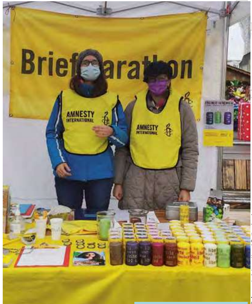
Amnesty Switzerland activists participate in Write for Rights 2021.

Human rights are not luxuries to be met only when practicalities allow.