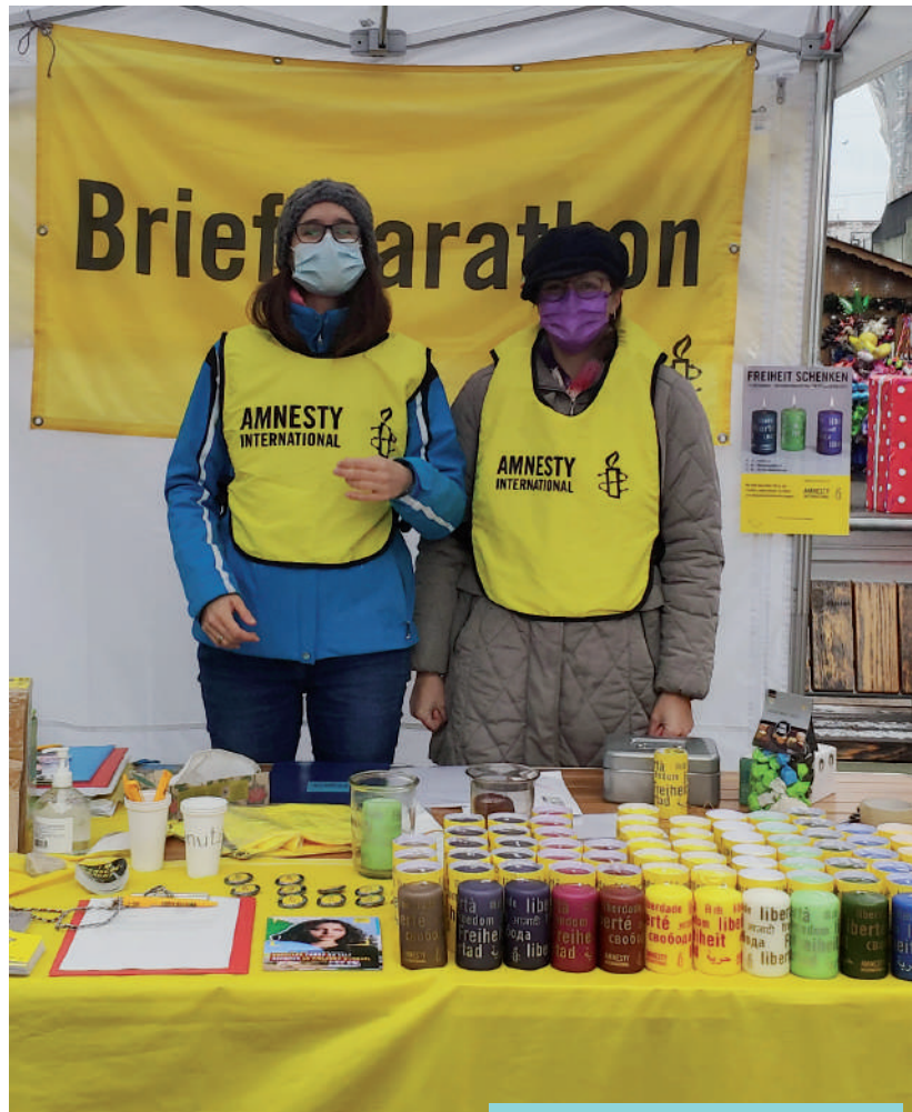
Amnesty Switzerland activists participate in Write for Rights 2021.

Human rights are not luxuries to be met only when practicalities allow.