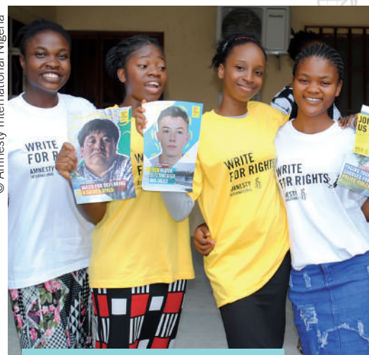
Amnesty Nigeria activists participate in Write for Rights 2021.

Read about the people we're fighting for: www.amnesty.org/writefor-rights