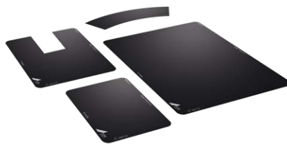
Imaging plates in various formats