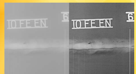
Image calibration is precisely and quickly performed by using a reference object. Further measurements in the image are based on this calibration.