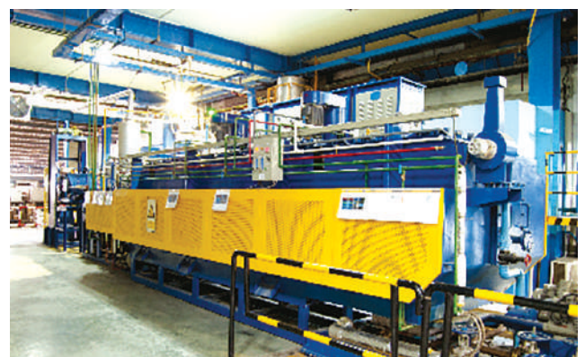
In house Heat Treatment process by Austempering for spring property