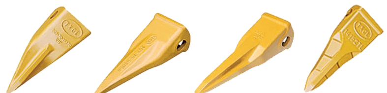
Tiger Long สำหรับงานเจาะหิน