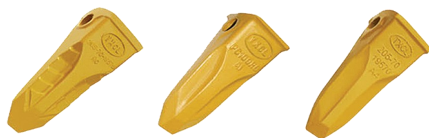
Rock Type สำหรับงานขุดหิน