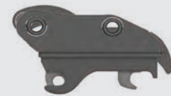
Hydraulic Quick Coupler

Enables cost-effective grading, sloping and land clearing. The bucket rotation has a tilt of 45 degrees in either direction. Universal hydraulic connections attach and detach hydraulics easily. The short tip radius and compact design deliver maximum strength.