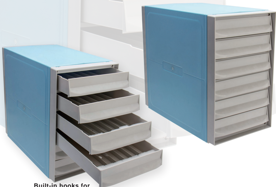
Built-in hooks for interlocking of drawers