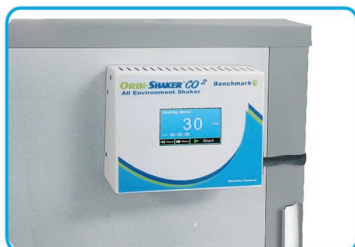
Touch Screen, remote controller adjusts shaker settings from outside of the chamber and magnetically attaches to most incubators