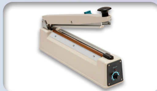
Heat Sealer with Cutter, Page 114