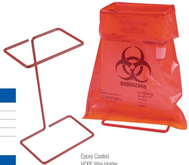
Epoxy Coated HDPE Wire Holder