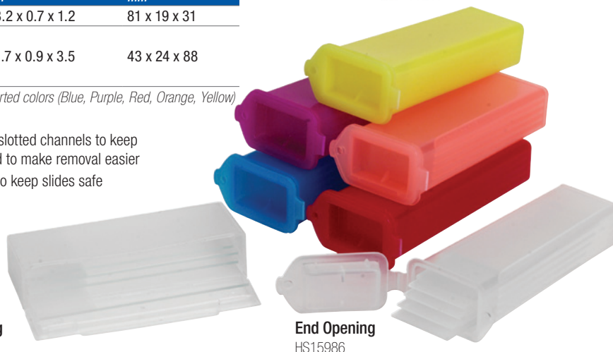
Side Opening HS15982