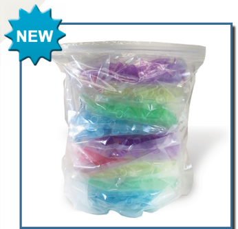
C2000-50AST Single Color Bags of 50