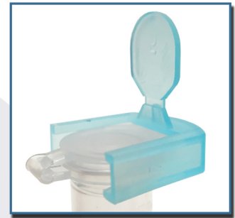
Free Stop-Pops™ in every pack!