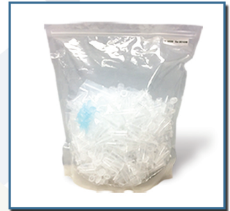
Self-Standing ZipLock Bag!