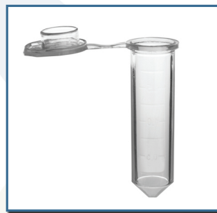
C2002 2.0mL Natural Color Tubes