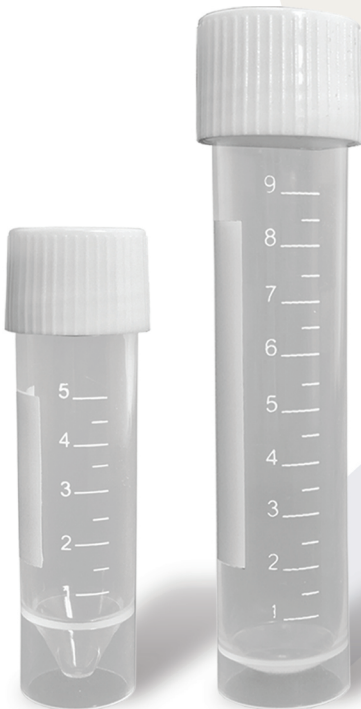
5mL 16 x 60mm