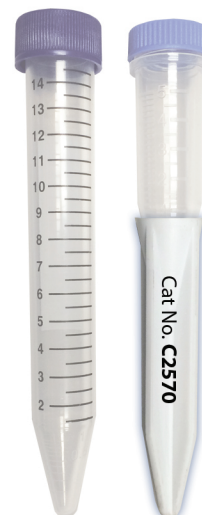
Adapter for 5mL tube in 15mL Centrifuge