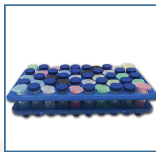
C2592 High volume gripper rack for 50 x 5mL tubes