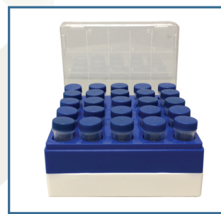
C2581 Polycarbonate cryobox for 25 x 5mL tubes