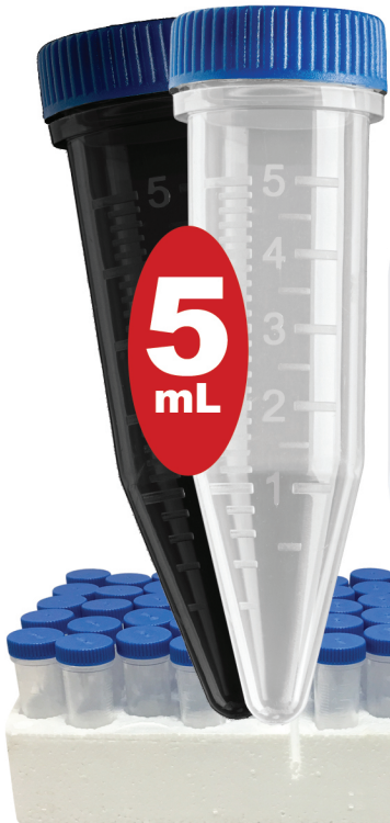
Sterile tubes in snap-away rack

Dimensions: 16x54mm (not including rim and cap). Total height with cap = 64mm.