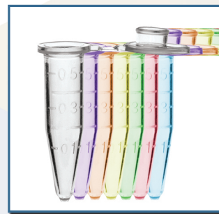
C2007 / C2007-AST 0.5mL in Natural or Assorted