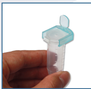
C2586 CapLock™ Clip recommended for extreme temperatures