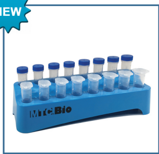
C2590 Two-tiered Pipetting Rack for 16 x 5mL tubes