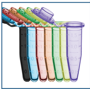
1.5mL also available in these great colors

The oversized cap (with frosted marking surface), combined with the unique ring & groove closure, enhances the security of the liquid-tight seal, while minimizing the required locking forces for a more ergonomic opening/closing of the tube caps.