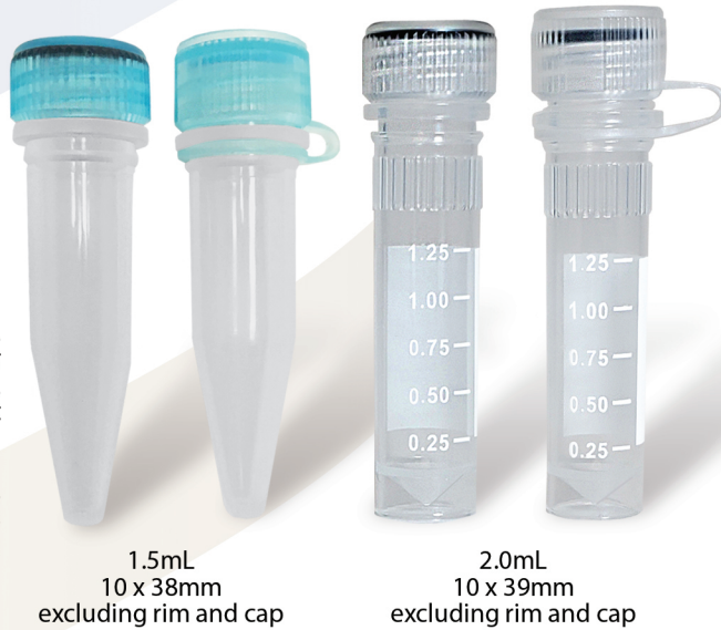
1.5mL 10 x 38mm excluding rim and cap

1.5mL economical tubes are also provided sterile and include O-rings, but are not graduated, and do not have a skirted bottom. These tubes are perfect for most general applications where a leak proof seal is a necessity.