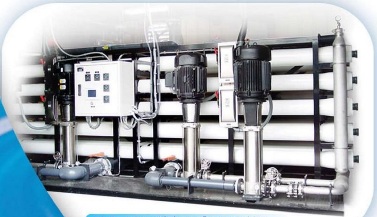
RO E – series with larger flow capacities

E4/E8/E12 for commercial applications such as restaurants greenhouses, grocery stores and other.