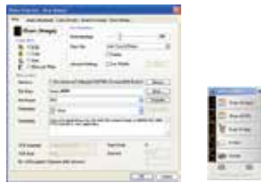
The Button Manager V2 main screen

Button Manager V2 makes it easy for you to scan and send your image to your favorite destinations with a press one button. Now the new version comes with an innovative feature to let you scan and automatically upload the scanned document to popular cloud repositories such as Google Docs, Microsoft SharePoint or FTP. In addition, the iScan feature allows you to insert the scanned image or recognized text after optional OCR (Optical Character Recognition) process to your text editor such as Microsoft Word to get your job done easily and quickly.