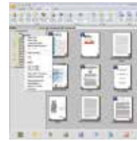
The PaperPort SE14 main screen

The Professional Choice to Organize and Share Your Documents