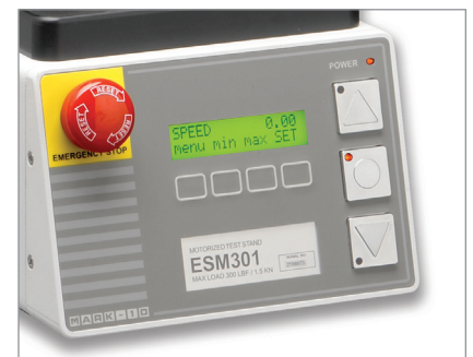
^ Digital controller contains a backlit LCD screen with menu choices for ease of setup and operation

^ The ESM301 and ESM301L are shown in typical configurations with Series 5 digital force gauges and G1061 wedge grips