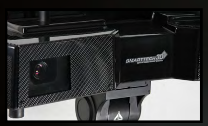
Modern carbon fiber cover