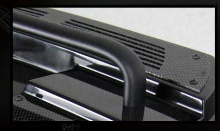
Dustproof system with industrial filter