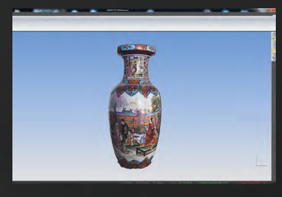
Triangle mesh with texture for colorful 3D printing.

All of these features make MICRON3D the most effective tool for archaeologist, biologist or art restorers. It is also good choice for demanding animations, colorful 3D printing or computer gaming.