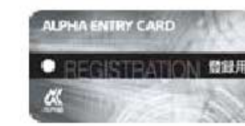
Registration card (2 pcs included)