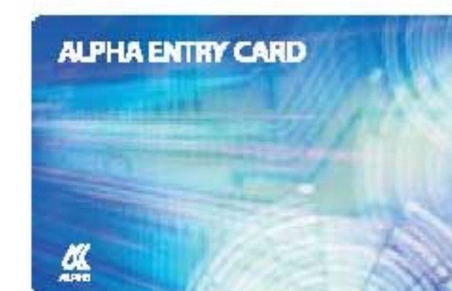
User Card (Sell Separately)