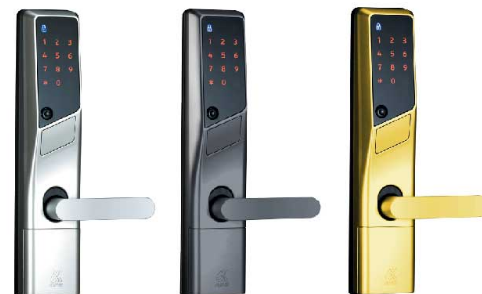
SILVER BLACK (MAT) GOLD