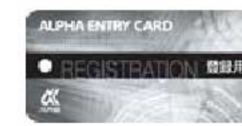
Registration card (2 pcs included)