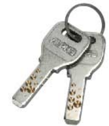
Dimple key (2 pcs included)