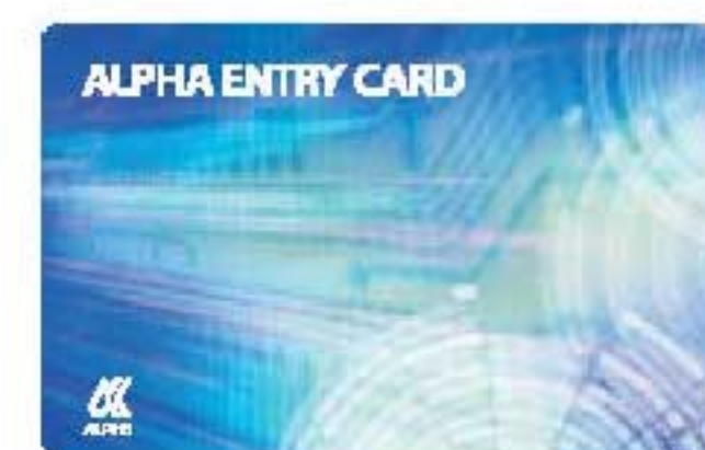
User Card (3 pcs included)