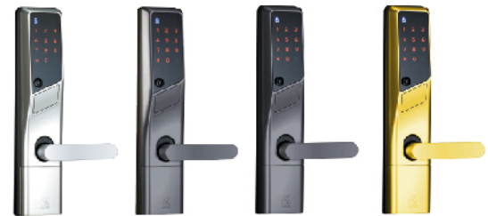
SILVER BLACK (MAT) BLACK GOLD