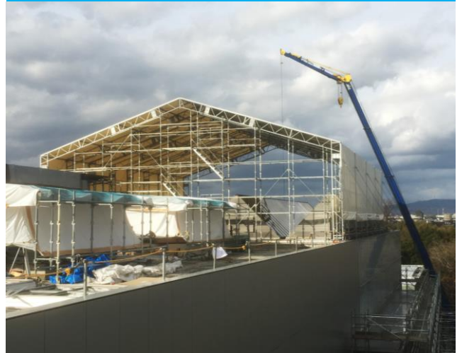
Roof Waterproofing Work