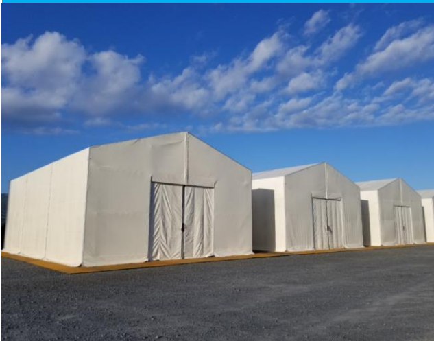
Plant repairing use/ Storage