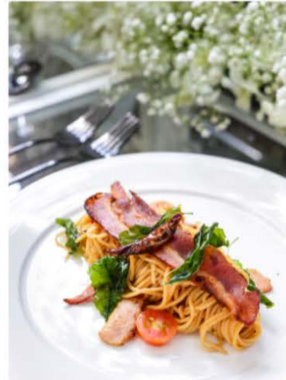
SPAGHETTI SPICY BACON