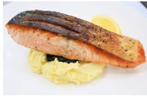
GRILLED SALMON WITH LEMON SAUCE