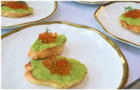
IKURA AND AVOCADO ON TOASTED