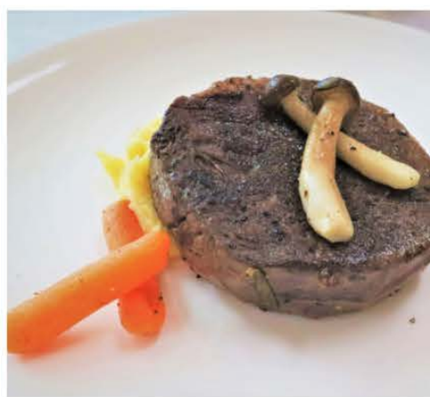
STEAK WITH CREAMY PEPPERCORN SAUCE