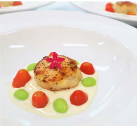
HOKKAIDO SCALLOP SEARED WITH WHITE WINE SAUCE