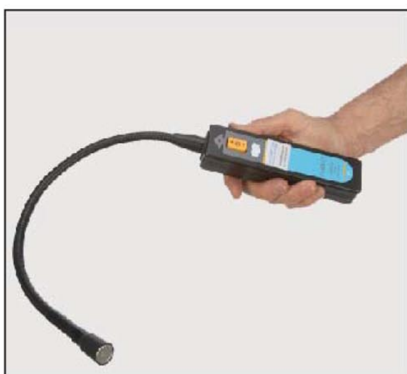
Above shows use of quality headphones and flexible pipe with sensor to get to a difficult spot to find an air leak.