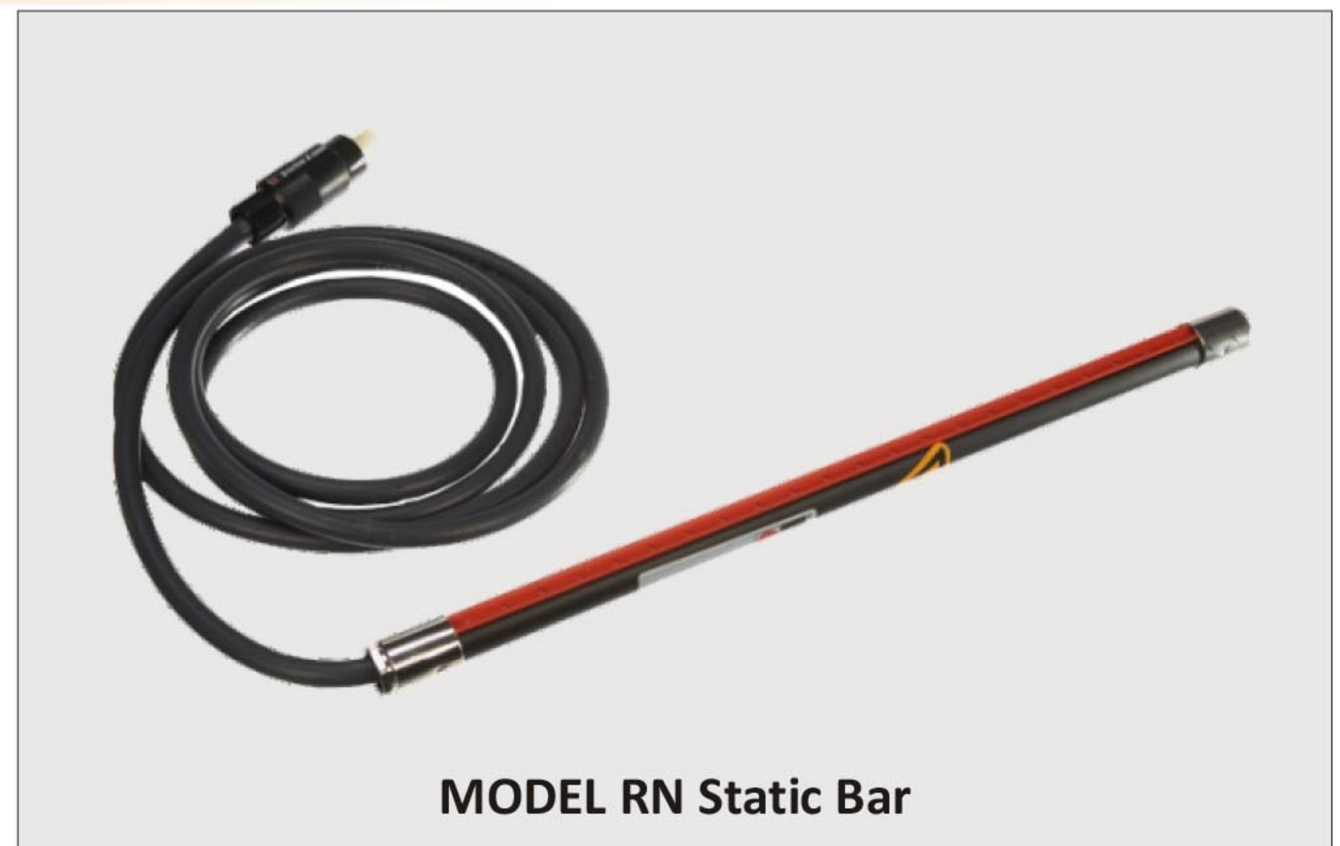
MODEL RN Static Bar

The HAUG RN Ionizing Bar is a powerful and rugged piece of equipment. Production interfering surface charges can be removed reliably and effectively - even at high operating speeds. The coaxial high-voltage plug-and-socket connection of the HAUG system X-2000 offers a unique advantage in that the gas tight high-voltage plug can be connected to the HAUG power pack easily and without tools. The flexible, coaxially shielded cable connects the ionizing unit with the voltage supply. The round construction of the RN ionizing bar permits the exact axial adjustment in the direction of travel of the material. The Ionizing Bar is safe to touch. Special wear-resistant electrodes guarantee long service life.