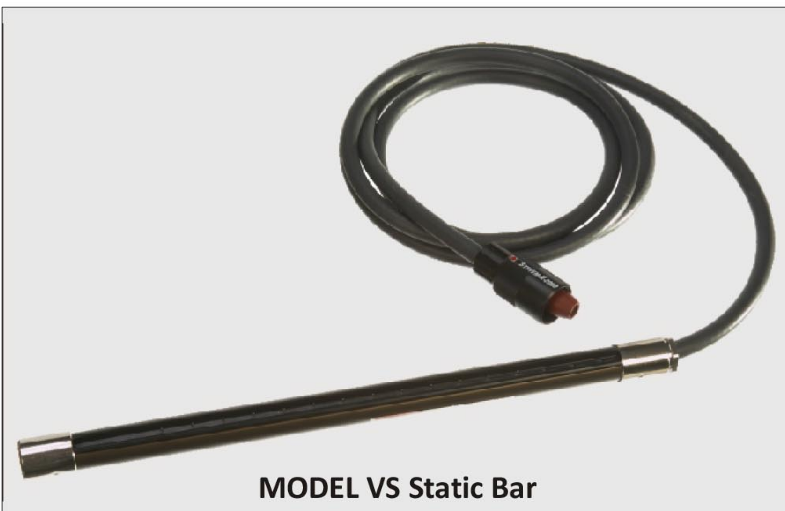
MODEL VS Static Bar