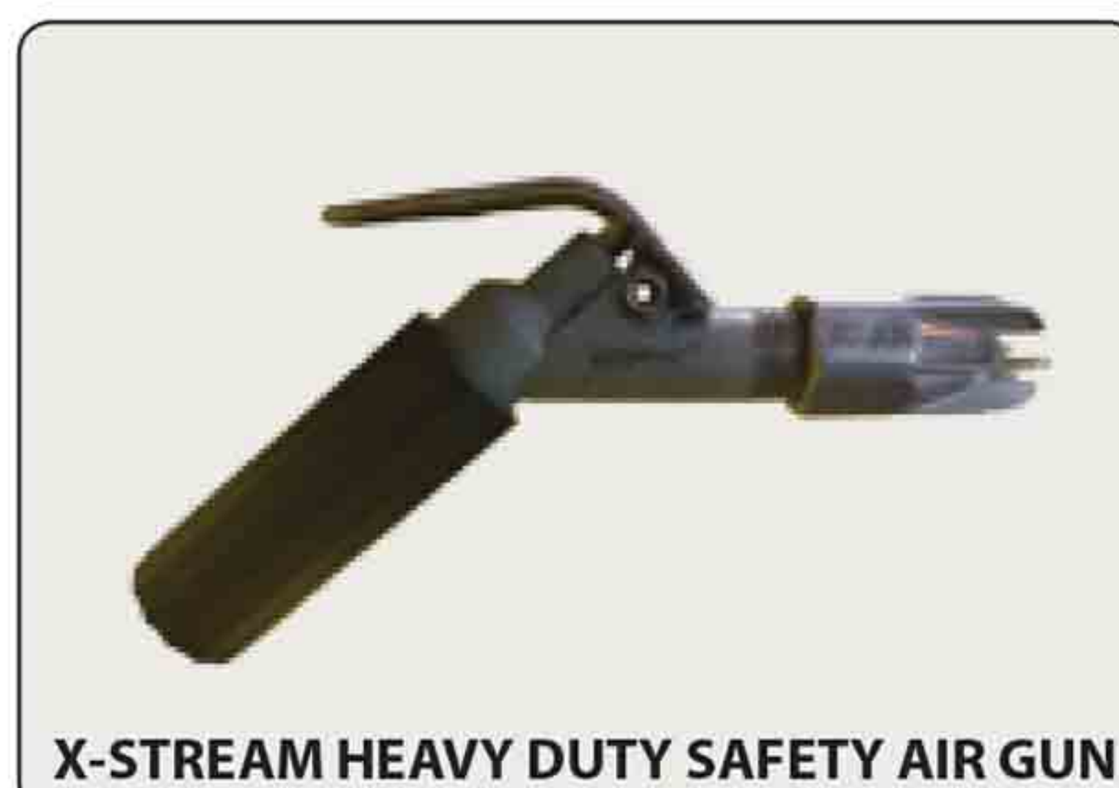
X-STREAM HEAVY DUTY SAFETY AIR GUN