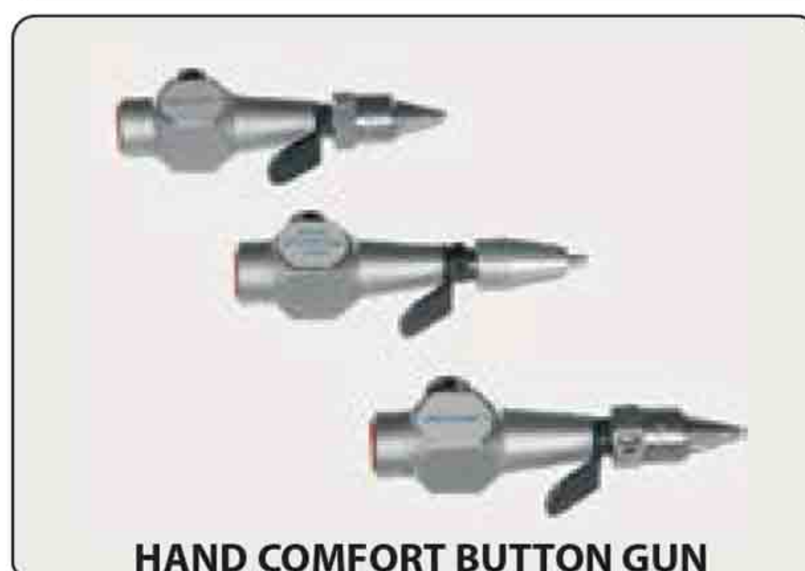
HAND COMFORT BUTTON GUN