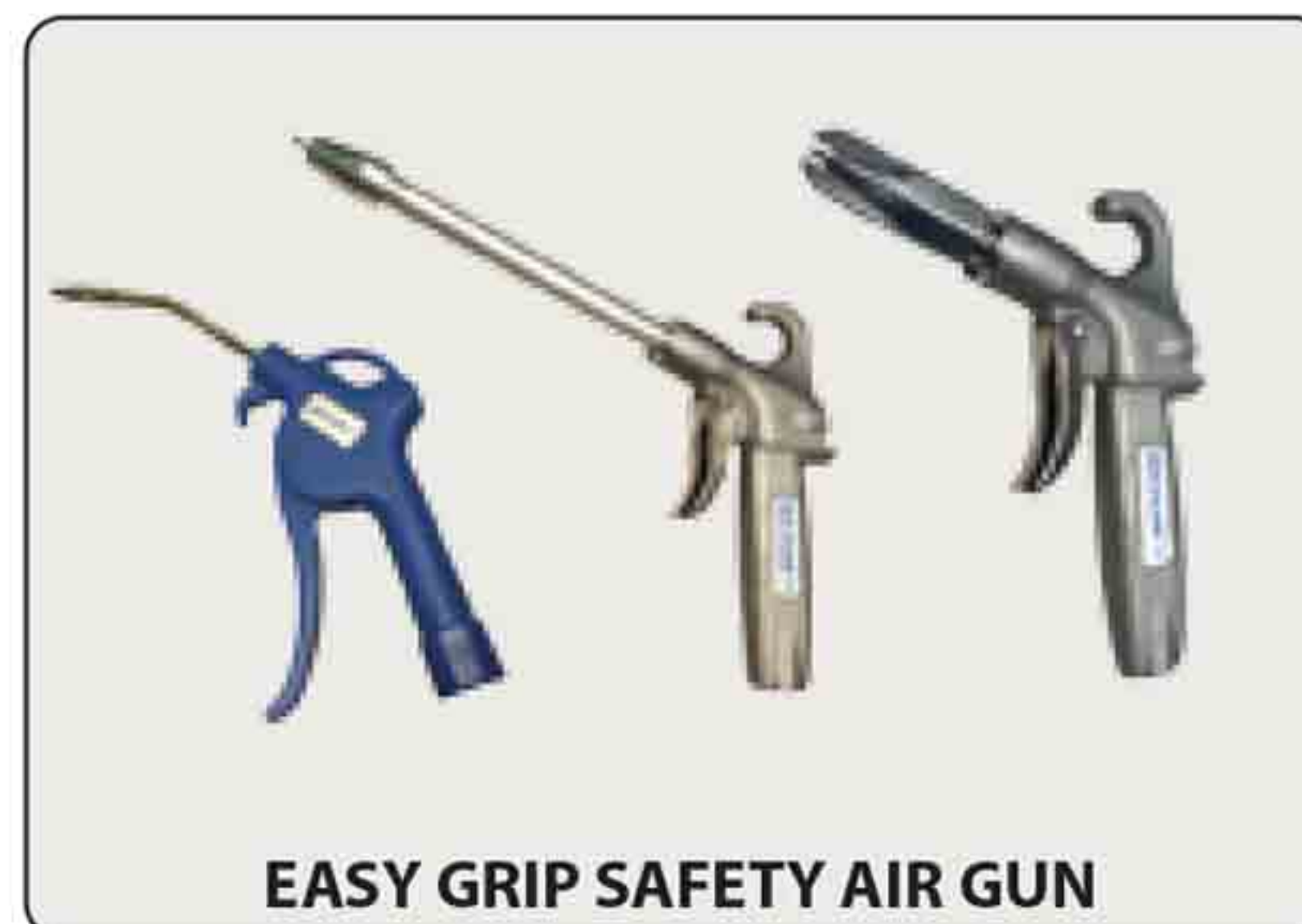
EASY GRIP SAFETY AIR GUN

If a very small nozzle is required the Model 47002AMS – 6 mm stainless steel Air Mag™ Nozzle may also be fitted to the unit.