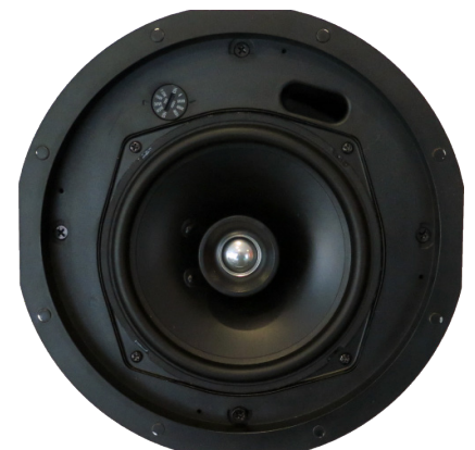
QF60CS Front Without Grille