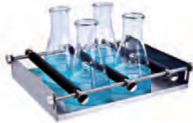
Adjustable Bar Platform UP-12