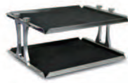
Double Deck Platform PP-4A