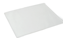
Sticky Pad SPD-GS used in the platform PP-4 or PP-4A