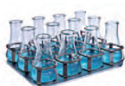
Flask Platform P12-100