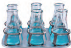
Flask Platform P6-250