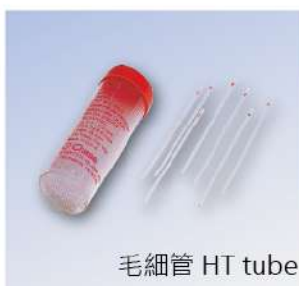
毛細管 HT tube

讀板、毛細管另購。 Reader and HT tubes not included.