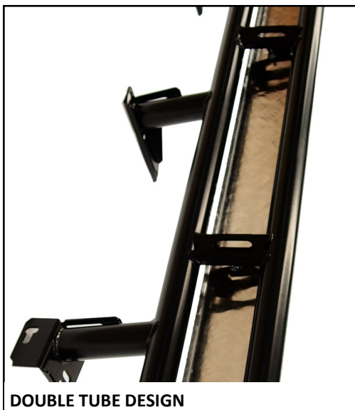
DOUBLE TUBE DESIGN

A: POLISHED ALUMINIUM ANTI-SLIP TOP STEP.