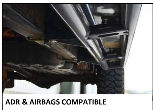
ADR & AIRBAGS COMPATIBLE

DESIGNED AND TESTED IN AUSTRALIA. TO MEET ADR72 AND ADR69 STANDARD.