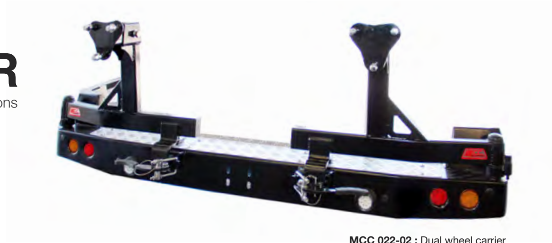
MCC 022-02 : Dual wheel carrier

D ouble jerry can holder / single wheel carrier