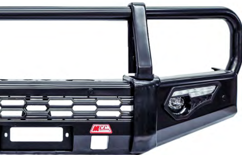
MCC 808-02 Steel A - frame