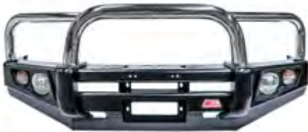
● MCC FALCON BAR : 707-01 Stainless steel triple loops