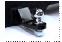
ARD rated and approved tow bar