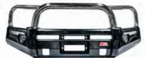
● MCC PHOENIX BAR : 808-01 Stainless steel triple loop