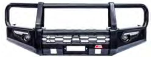
● MCC PHOENIX BAR : 808-02 Top model : Steel A - frame with LED fog lights