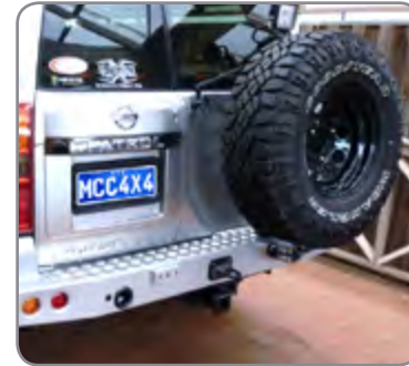
MCC REAR BAR : 022-02 Single wheel