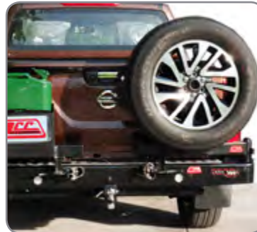
MCC REAR BAR : 022-02 Single jerry can holder / single wheel