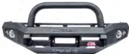
● MCC ROCKER BAR : 078-01 Optional single loop in stainless steel or black steel