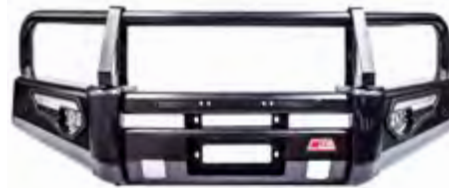
● MCC PHOENIX BAR : 808-02 Standard model : Steel A - frame