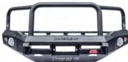
● MCC ROCKER BAR : 078-02 Triple loops in black steel