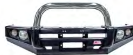
● MCC FALCON BAR : 707-01 Optional single loop in stainless steel or black steel