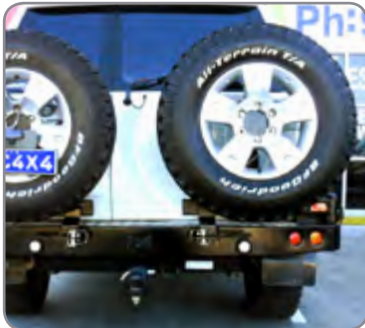
MCC REAR BAR : 022-02 Dual wheel