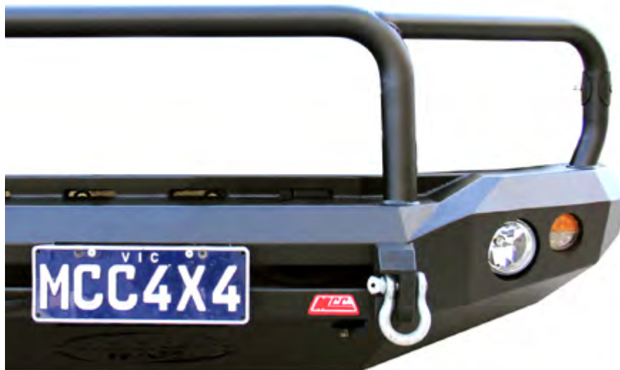
MCC 078-02 Rocker bar triple loops