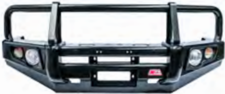
● MCC FALCON BAR : 707-02 Steel A - frame