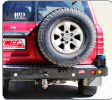
MCC REAR BAR : 022-02 Rear bar only