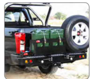
MCC REAR BAR : 022-02 Double jerry can holder / single wheel