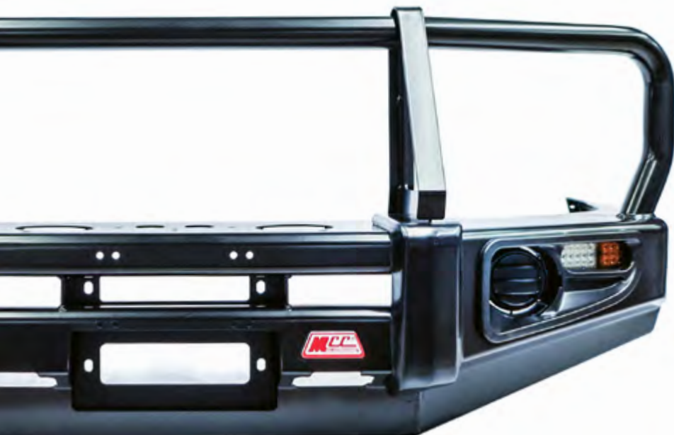
MCC004-02 Classic bar with optional fog lamp kits