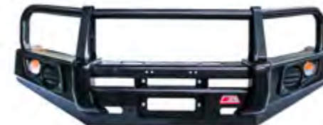
● MCC FALCON BAR : 707-02 Classic Falcon bar with no fog light