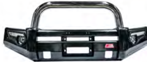
● MCC PHOENIX BAR : 808-01 Optional single loop in stainless steel or black steel