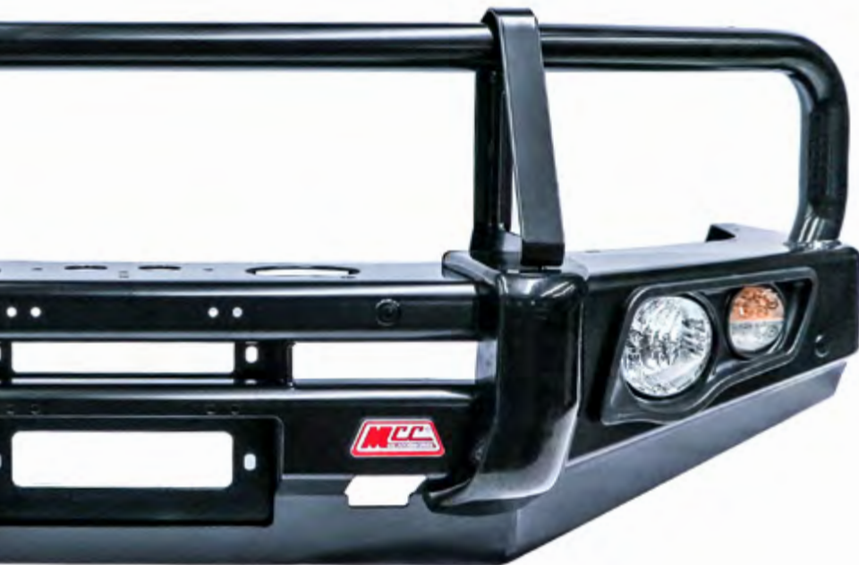
MCC 707-02 Steel A - frame