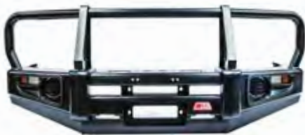
● MCC CLASSIC BAR : 004 - 02 Optional add on fog lamp kit 110 mm.